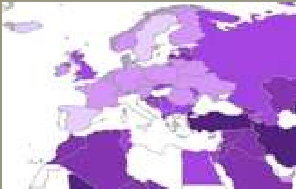
Gov Compliance CEDAW