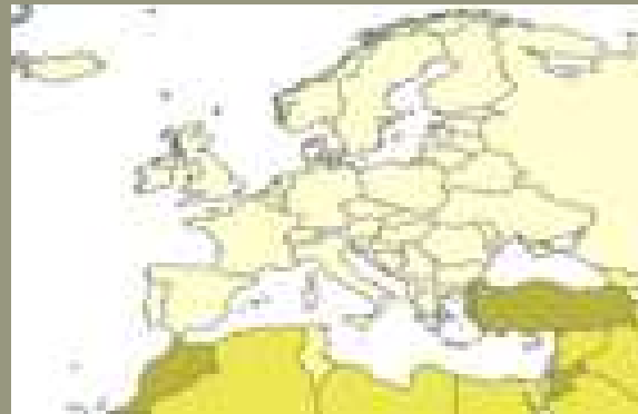
Incidence of Polygyny